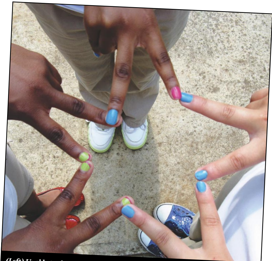
(Left) Unable to show their faces, the young girls are photographed in a flower bed planted as part of horti-therapy. (Top) The girls create a star photo image to show they are all stars. The peace signs interconnect to make the star, like their interconnected friendship. The bright colors of their nail polish remind us they are just little girls.

When speaking on the issue of human trafficking, with an emphasis on CSEC, Sharon references